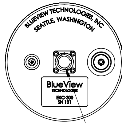
IMPULSE MKS-310-FCR CONNECTOR