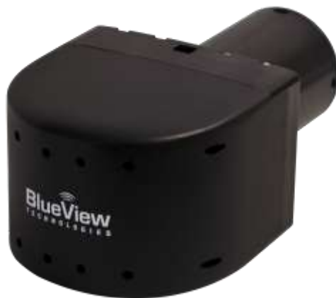
P450-130 2D Imaging Sonar