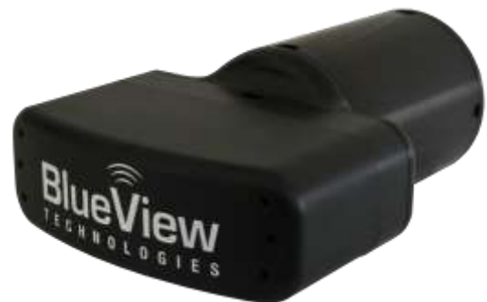
P450-45 2D Imaging Sonar

"The new P450 Series is a multibeam imaging sonar game changer, the real-time feedback coupled with the expanded detection range exceeds anything out there," stated Jason Seawall, BlueView COO. Seawall added "these new systems are perfect for work-class ROVs,